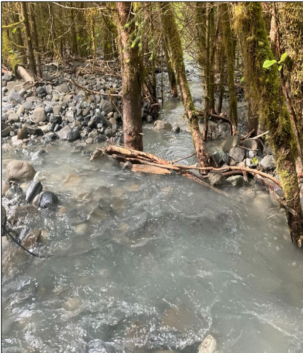
Figure 2.–Mobile braid system, looking downstream at waypoint 1098.