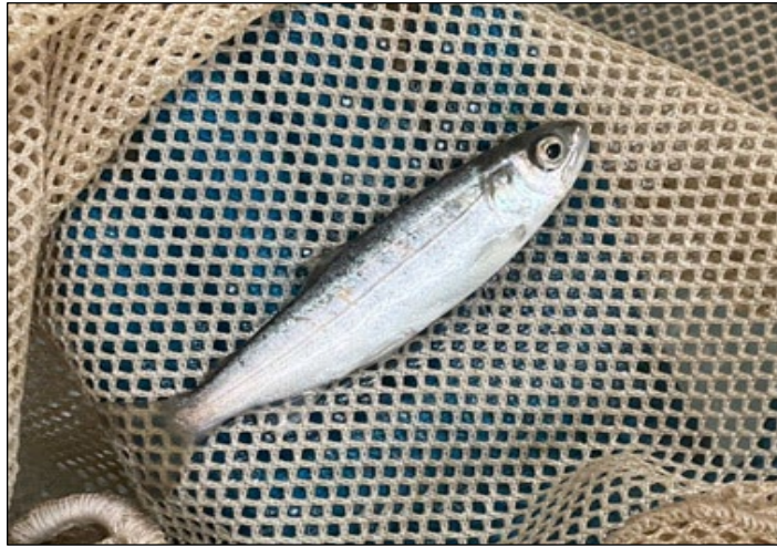
Figure 1.–Coho salmon caught at waypoint 1098.