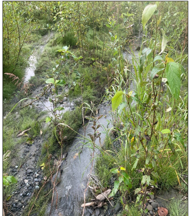
Figure 3.–Looking downstream at waypoint 1095.